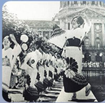
SF Civic Center, 1974, BCA 75th Anniversary Book